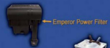
Emperor Power Filter