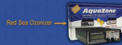
Red Sea Ozonizer