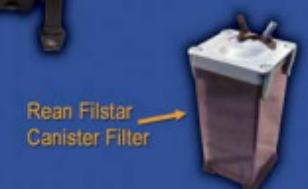
Rean Filstar Canister Filter