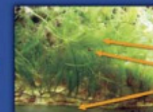
Inside a Refugium Macroalgae Crustaceans Deep Sand Bed