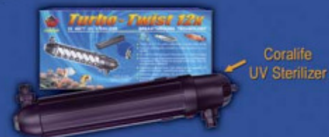
Coralife UV Sterilizer

Under Gravel Filters -- Under Gravel Filters pull water and waste through the gravel for biological filtration. The remaining waste is removed by siphoning the gravel during water changes. (not recommended)